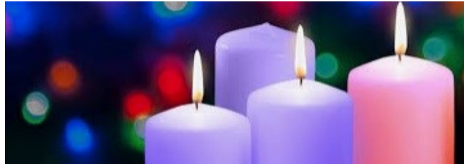
Third Advent Candle

Caffeine & Calories: The weekly social hour continues, after Mass.