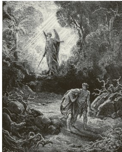
Adam and Eve Driven Out of Eden

◆ Sun, June 16 @ 11:00 a.m. Eleventh Sunday in Ordinary Time