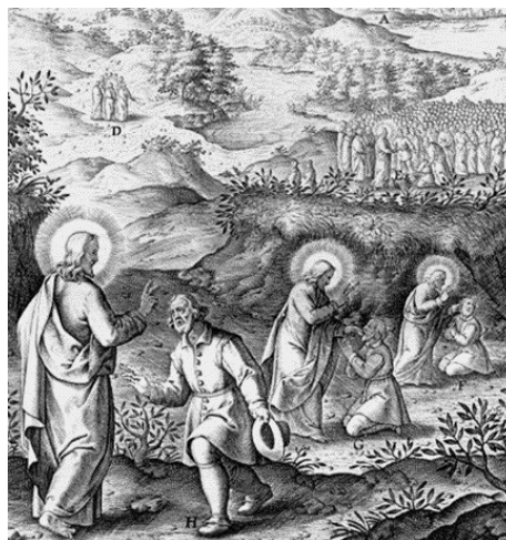
Jesus Heals a Deaf-Mute