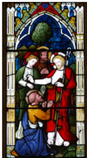
Peter Proclaims Jesus