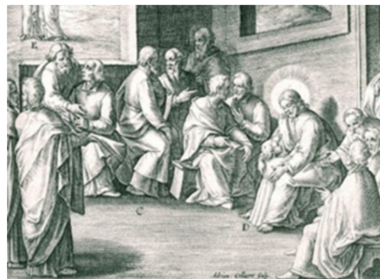
Jesus teaches the disciples about fraternal correction.

WELCOME: NO MATTER WHAT YOUR PRESENT OR PAST STATUS IN THE CATHOLIC CHURCH. NO MATTER YOUR PERSONAL HISTORY, AGE, RACE OR BACKGROUND. YOU ARE INVITED, WELCOMED, ACCEPTED AND LOVED AT ST. GENEVIEVE CATHOLIC PARISH.