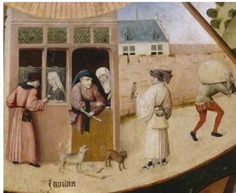
Table of the Mortal Sins (Envy)

WELCOME: NO MATTER WHAT YOUR PRESENT OR PAST STATUS IN THE CATHOLIC CHURCH. NO MATTER YOUR PERSONAL HISTORY, AGE, RACE OR BACKGROUND. YOU ARE INVITED, WELCOMED, ACCEPTED AND LOVED AT ST. GENEVIEVE CATHOLIC PARISH.