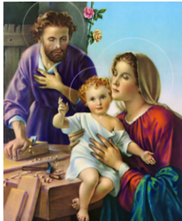
Feast of the Holy Family