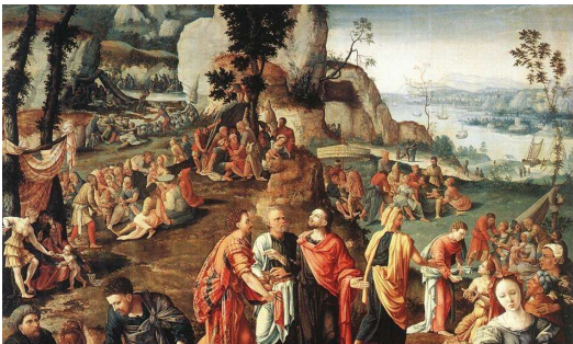
The Miracle of the Loaves and Fishes Lambert Lombard (1505/1506–1566)