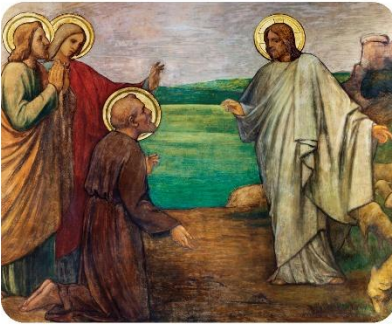
REBATA SEMAKOVA / SHUTTERSTOCK

Go to DearPadre.org to send your question and to learn more about Dear Padre .