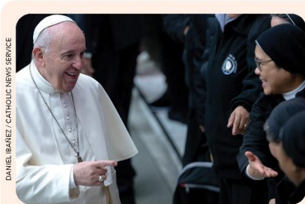
DANIEL BAÑEZ / CATHOLIC NEWS SERVICE