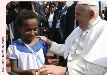
CATHOLIC NEWS SERVICE