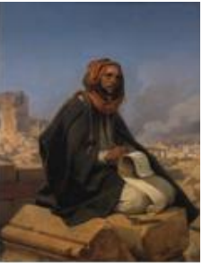
Jeremiah on the Ruins of Jerusalem