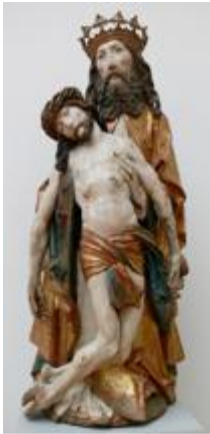
God the Father with the Suffering Christ, AKA The Throne of Mercy