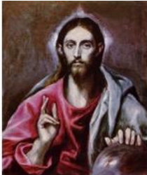
Christ the Pantocrator Greco (1541-1614)

Friends, we come to the Thirty-third Sunday in Ordinary Time, which means that next Sunday is the final Sunday of the liturgical year. During this time, the Church always gives us apocalyptic readings, and our Gospel today is from “the little apocalypse” in the Gospel of Luke. Apokalypsis in Greek does not mean “end of the world”; it means “unveiling”—taking away the kalyptra , the veil. This is why, when apokalypsis is rendered in Latin, we get revelatio , revelation—taking the velum , the veil, away. So apocalyptic literature is all about the showing forth of a new world. But that has to be preceded by a sort of shaking of the old world. ~ Bishop Robert Barron