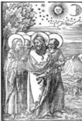
The End Times Virgil Solis (1514-1562)