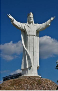
Jesus Christ King of the Universe Monument - Poland

Our first reading today takes us back to when the elders of the twelve tribes of Israel anointed David king. In the second reading we hear an early church prayer, extolling Jesus in words like the ones we recite today in the creed. The Gospel offers two very different ways in which the men condemned with Jesus viewed the inscription on his cross. In harmony with the good thief, may we sing out in today’s responsorial psalm, “Let us go rejoicing to the house of the Lord.” Question of the Week: As Christ is king of both this world and the next, how do I allow him to rule my life right now? What can I do to model the self-sacrificing love he proved on the cross?