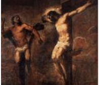
Christ and the Good Thief