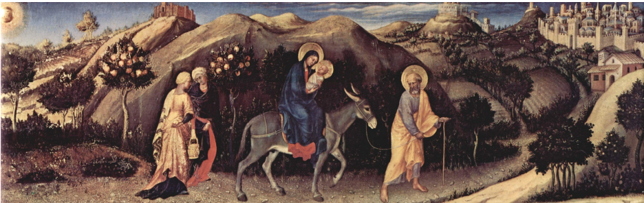
da Fabriano Gentile (ca. 1370-1427)

Please remember Catholic Charities of Eastern Washington Christmas Collection Scan the QR code or go to www.donateCCEW.org , or just write a check to Catholic Charities Eastern Washington, and put it into the collection basket.