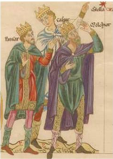
The Three Magi (Balthasar, Caspar, Melchior)