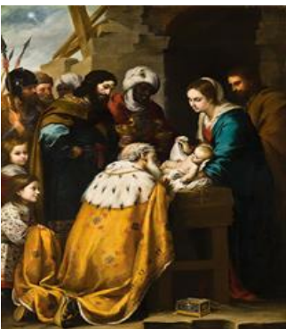
Adoration of the Magi by Bartolme Esteban Murillo

Following First Friday Mass and Benediction, there will be Adoration of the Lord until 12:00 p.m. Come and adore the Lord in the Blessed Sacrament for a few minutes or an hour or more. Of course, you can always come into the church and adore the Lord present in the Tabernacle whenever it is convenient for you.