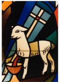
Agnus Dei with Vexillum