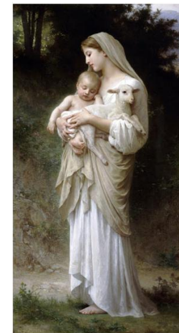
Behold the Lamb of God, which taketh away the sin of the world.

Following First Friday Mass and Benediction, there will be Adoration of the Lord until 12:00 p.m. Come and adore the Lord in the Blessed Sacrament for a few minutes or an hour or more. Of course, you can always come into the church and adore the Lord present in the Tabernacle whenever it is convenient for you.