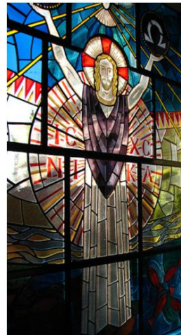
Christ our Light